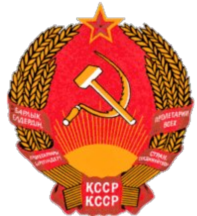
The emblem of the SSR

On a recent tour of the U.N. , not one mention was made of any of this by our guide. Hiss' name was not mentioned one time. When pictures of the founding conference contained his picture, our U.N. guide avoided telling us who it was.